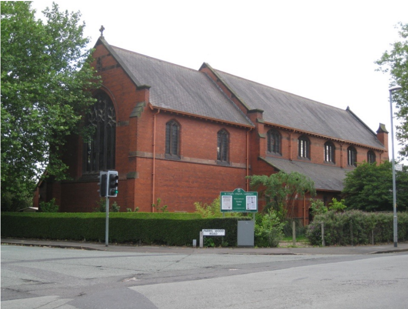
From Mauldeth Road/Egerton Road corner