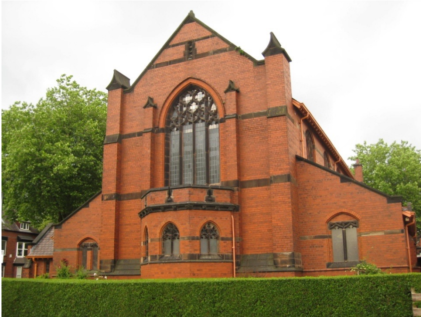
From St. Chad's Road