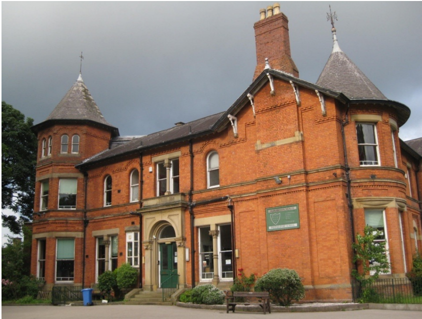
Cotton Lane side