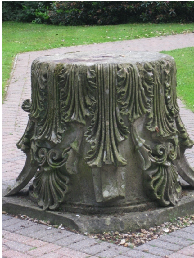
Base of something in the grounds