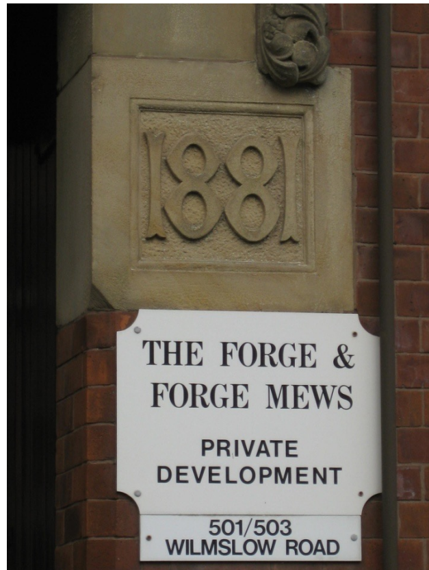
Part of façade detail