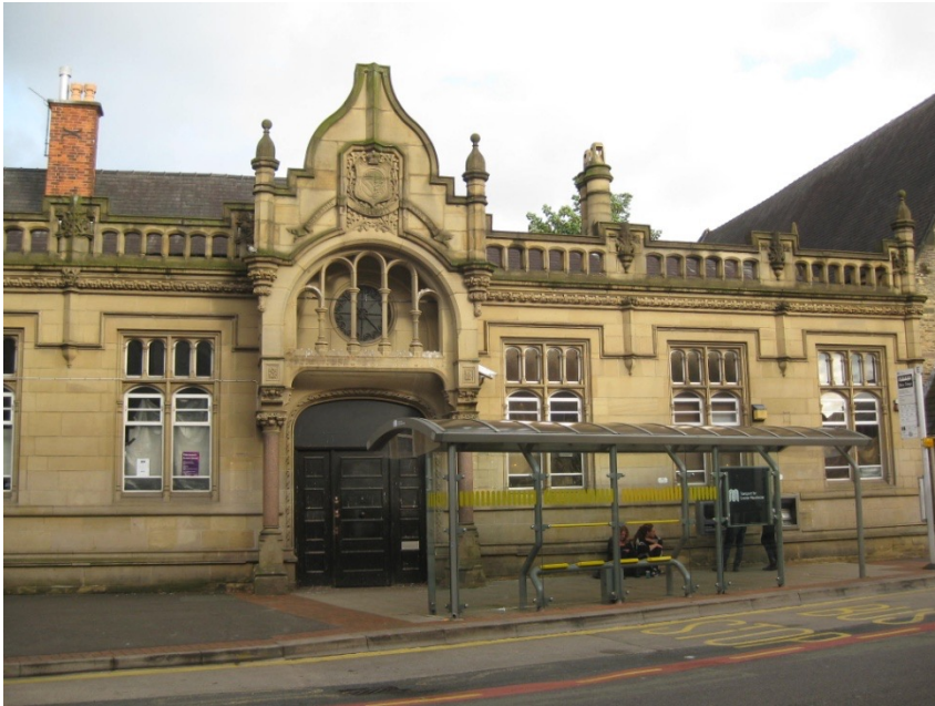
Wilmslow Road front