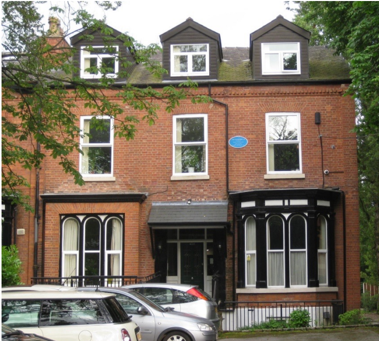
Photo taken through the gates